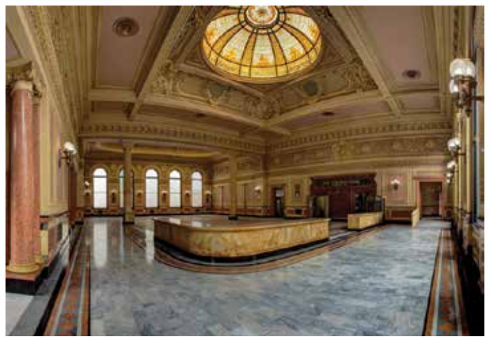
Figure 2. The Hibernia Bank Building main banking hall with banking counters and stained glass laylights overhead.

A number of available standards and guidelines were consulted during the design of the seismic retrofit. With design forces remaining in the near-elastic range to protect the masonry, the retrofit is very much in keeping with the spirit of the ASCE 41 linear elastic procedures. Full application of ASCE 41 procedures, however, would have relied on analytical studies of very limited accuracy and benefit. This speaks to the need to maintain the provisions of the CHBC to provide a seismic retrofit basis for buildings with archaic materials and systems that are