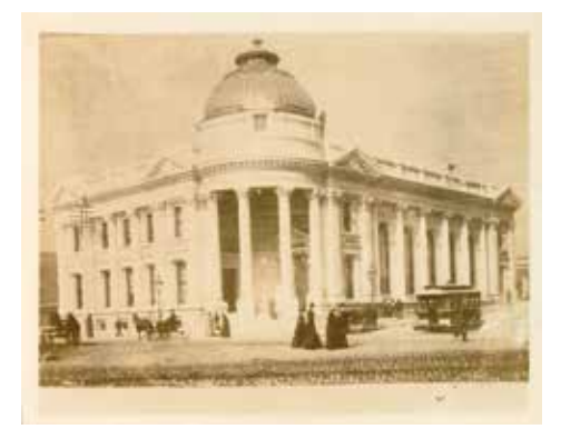
Figure 1. Hibernia Bank Building in 1894, before the addition.

France. Other Pissis masterpieces include the Flood Building, the Emporium, and Temple Sherith Israel, all of which also survived the 1906 earthquake. The building interior is dominated by a vast banking hall with a ceiling 35 feet above the